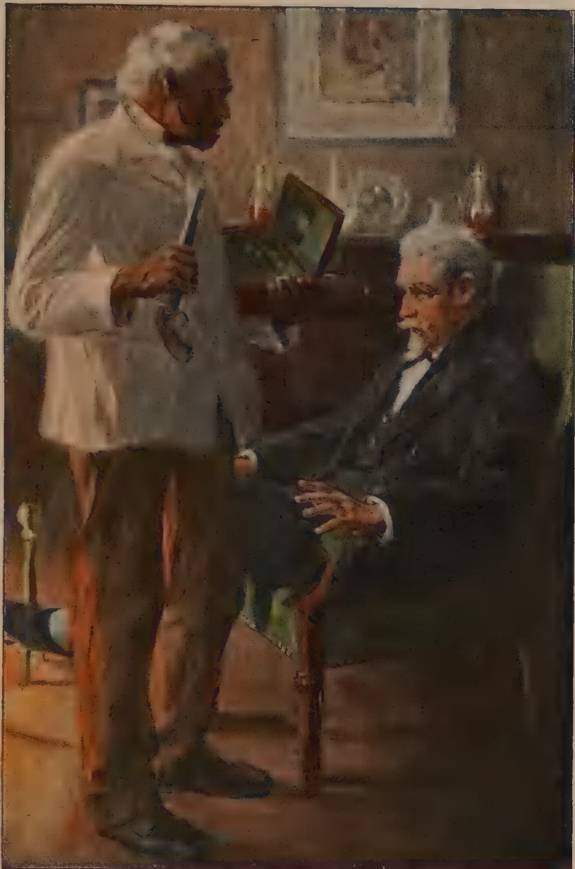
"TAKE THEM UPSTAIRS AND PUT THEM ON MY DRESSIN' TABLE."